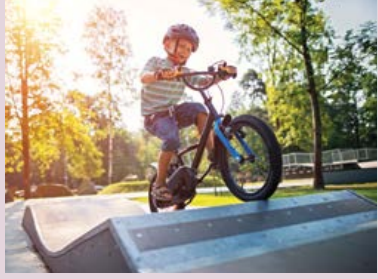
8 BMX bike track