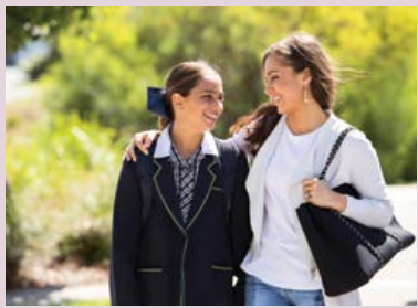
2 Secondary school