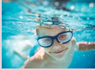
9 Aquatic Centre