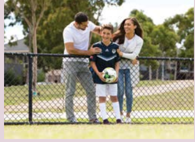
7 Sporting fields/oval: Soccer, AFL and Cricket