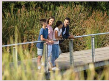
3 Neighbourhood parks