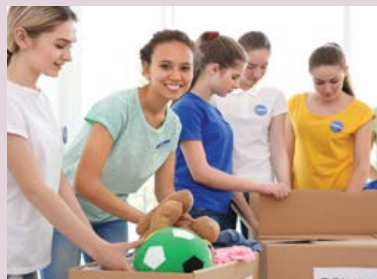
12 Community Centre