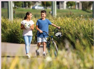
5 Walking, running and cycling paths