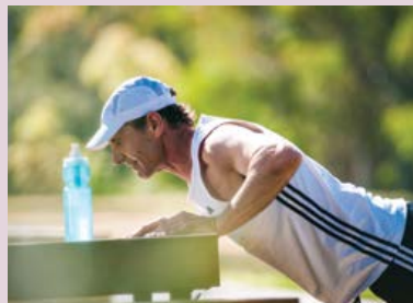
6 Fitness Circuit