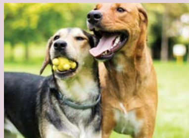
10 Designated off leash dog area