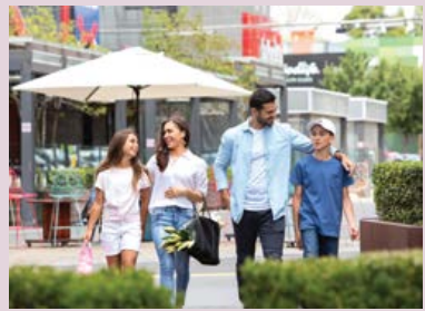
1 Town Centre

Located in the immediate Sienna North area, the PSP facilities include a new town centre, primary and secondary schools, local parks with picnic shelters, multi-court tennis, an aquatic centre, a fitness circuit, sports fields, and even an off-leash dog park all within minutes of home.