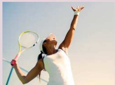
11 Sports reserve including tennis multi-courts